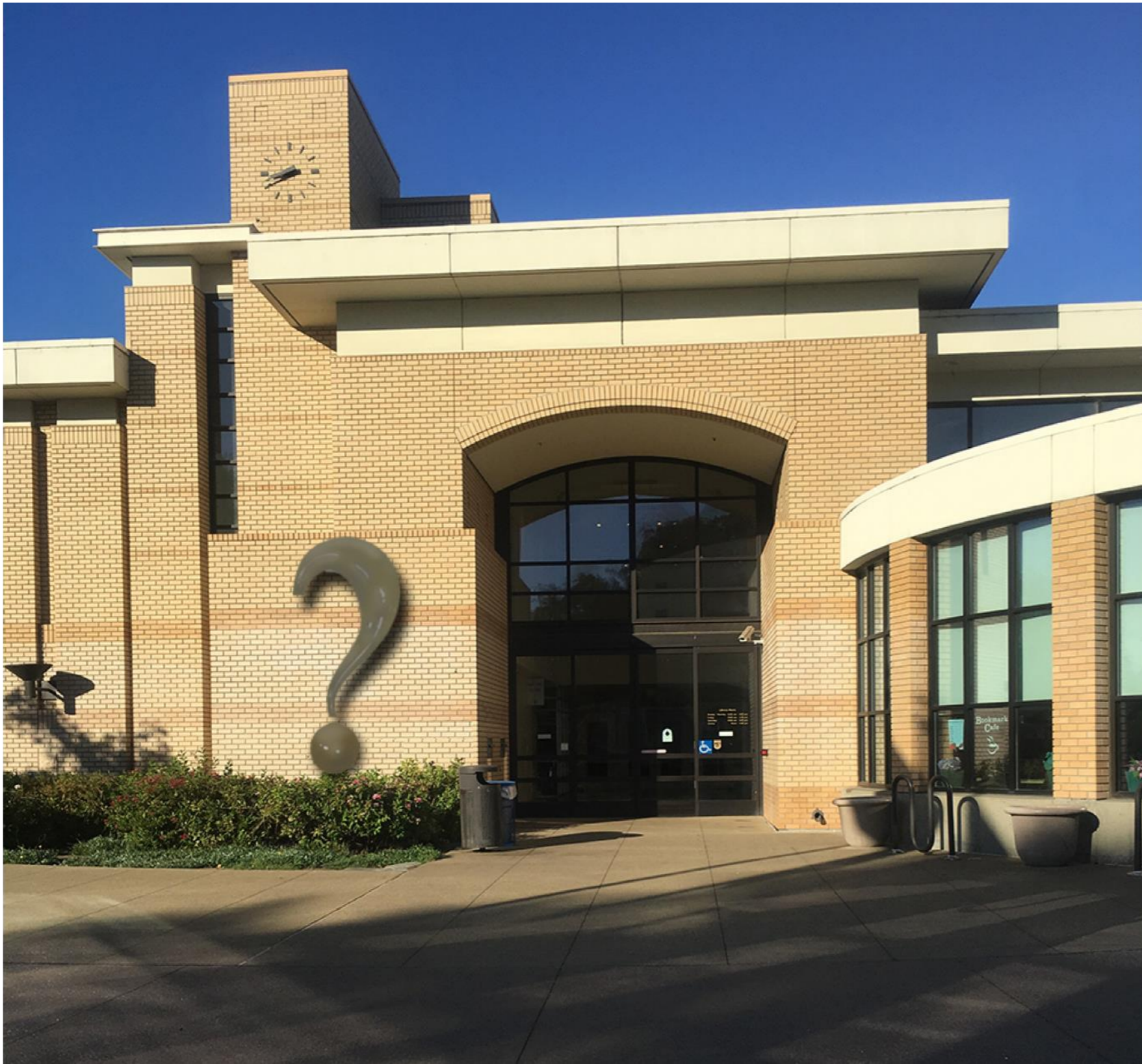
Curiosity, 2020 Bronze with Steel reinforcement